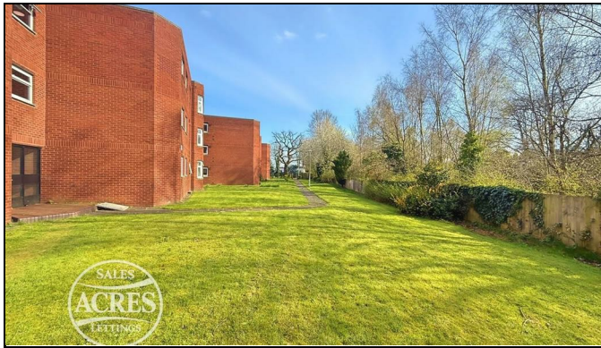
Ethelred Close, Sutton Coldfield, B74 4BX